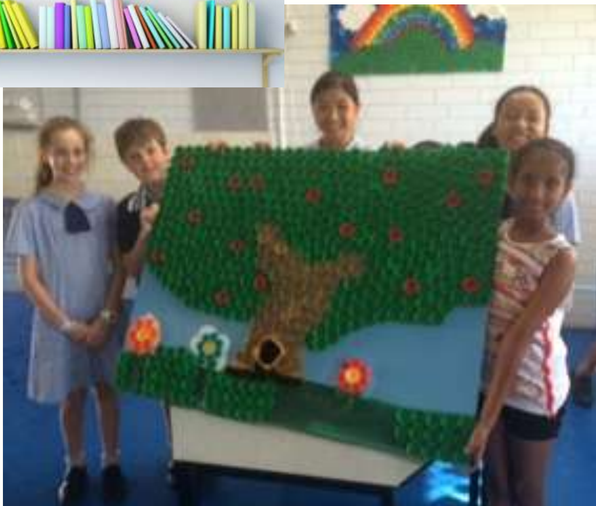
Tree and rainbow art made out of different colourful bottle tops!!!